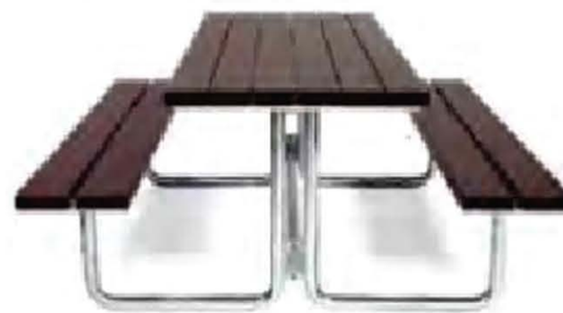
Park picnic table TB-06

Whole size: 1800*1540*720mm Table: 1800*600*720mm Bench: 1800*300*420mm Material: perforated general steel (2.5mm thk) Support pipe: Φ42mm steel tube