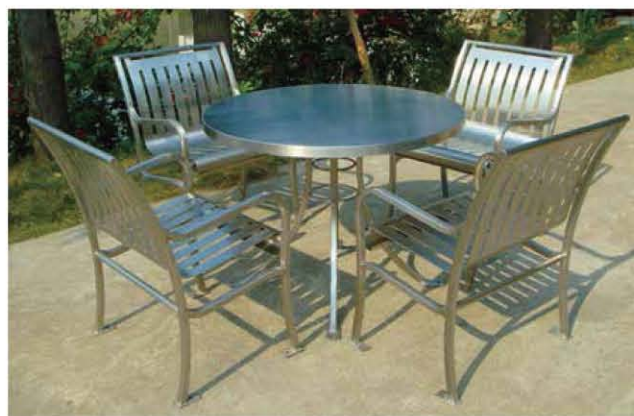
Table and chairs TB-04

Whole size: Φ2200*770mm Table: Φ1200*770mm Bench: 1100*270*470mm Material: perforated steel plate (2.5mm thk) Support pipe: Φ48mm steel tube