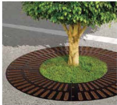
Cast iron tree grate / TG-01

Size: \Phi 125*750*\Phi 266\text{mm} This bollard is made by mould. The steel chain is provided. Weight: 35kgs Surface treatment: ▪ Derusting-zinc rich powder -electrostatic powder spray Powder: Akzo Nobel