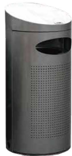
Stainless steel trash bin BS-12

Size: Φ 380*850mm Material: 201/304/316 perforated stainless steel plate (1.2/1.5mm thk) +0.5mm thk galvanized iron plate /stainless steel liner Finish: wire drawing