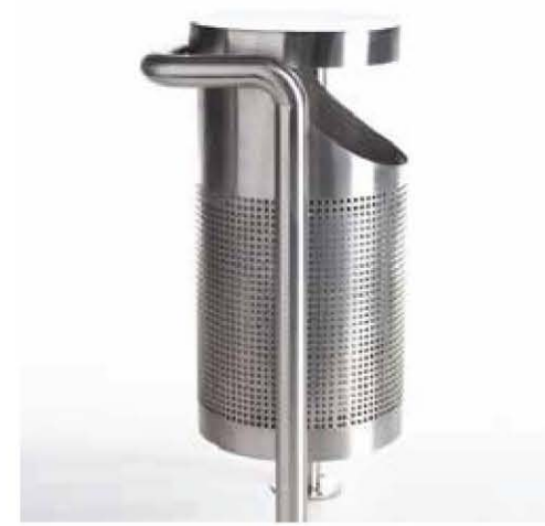
Stainless steel round trash bin BS-15

Size: 520*460*1000mm Material: 201/304/316 perforated stainless steel plate (1.2/1.5mm thk) +0.5mm thk galvanized iron plate /stainless steel liner Finish: wire drawing Pole: Φ 42mm