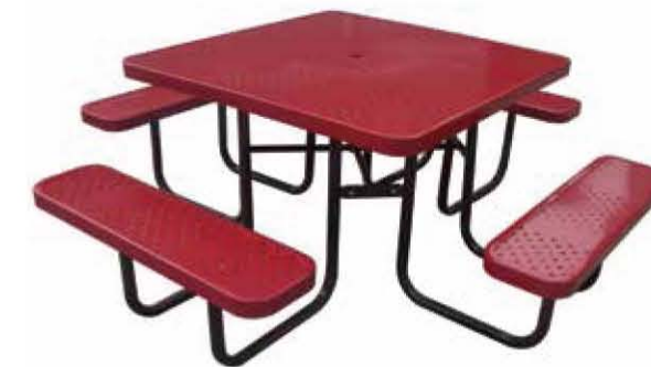
Park picnic table TB-09

Whole size: 1800*1510*780mm Wood: solid wood (30mm thk)/wood plastic composite Paint: polyester paint /Germany VMS outdoor paint Support pipe: 60*30mm square tube