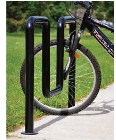
Bike racks / BR-03

Material: general steel tube( \Phi 60\text{mm} ) Size: 1200*60*800mm Surface treatment: ▪ Derusting-zinc rich powder -electrostatic powder spray Powder: Akzo Nobel