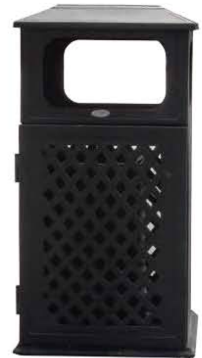
Square trash bin / BS-09

Size: 400*400*850 mm/ 450*450*900 mm Material: 2.0/2.5mm thk steel body +0.5mm thk galvanized iron plate liner