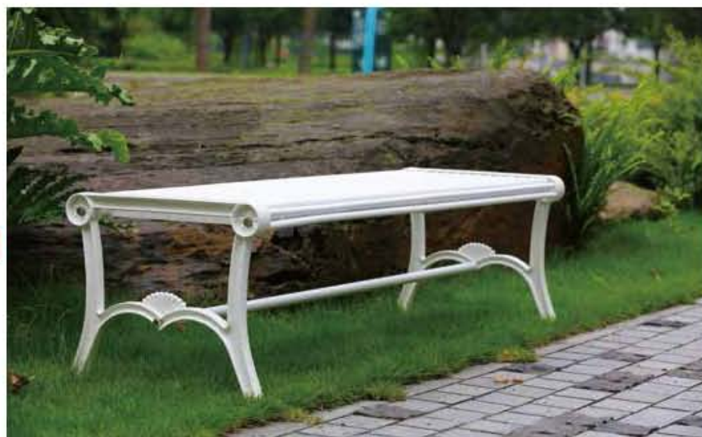
Backless garden bench / FS-12

Size: 1600*615*440mm Seat: 2.0/2.5mm thk perforated steel plate Pole and beam: \Phi 60mm steel tube Surface treatment: ■ Derusting-spray zinc rich powder -electrostatic powder spray Powder: Akzo Nobel