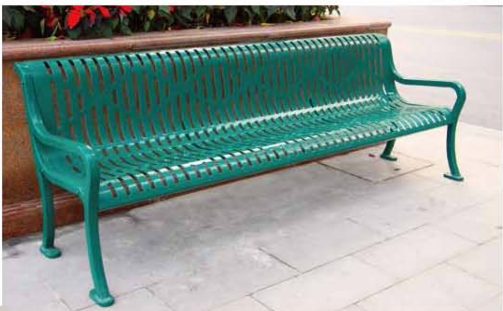
Park bench FS-06

Size: 1800*615*440mm Leg: cast iron leg (21/28kgs/pair) Seat: Φ16mm steel tube Material: general steel/304SS/316SS Stainless steel surface treatment: wire drawing General steel surface treatment: ■ Derusting-spray zinc rich powder -electrostatic powder spray Powder: Akzo Nobel