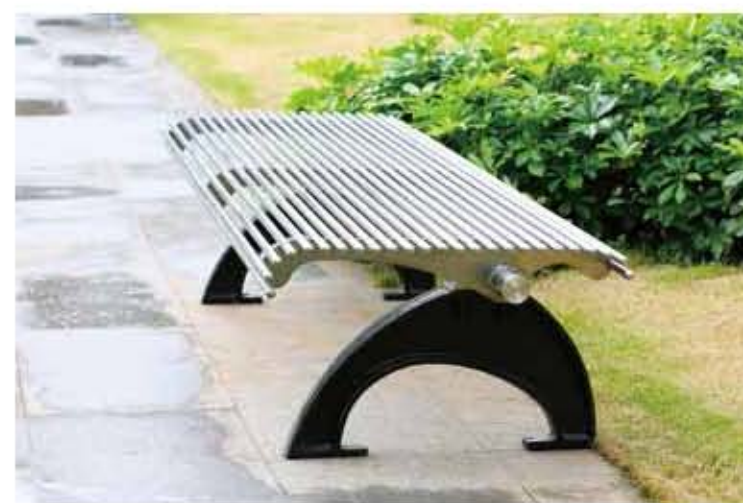
Cast Iron garden bench FS-09

Size: 1800*690*940mm Leg: cast iron leg (50kgs/pair) Seat: 4.0mm thk flat steel by laser cut Surface treatment: ■ Derusting-hot dip galvanizing -electrostatic powder spray ■ Derusting-spray zinc rich powder -electrostatic powder spray Powder: Akzo Nobel