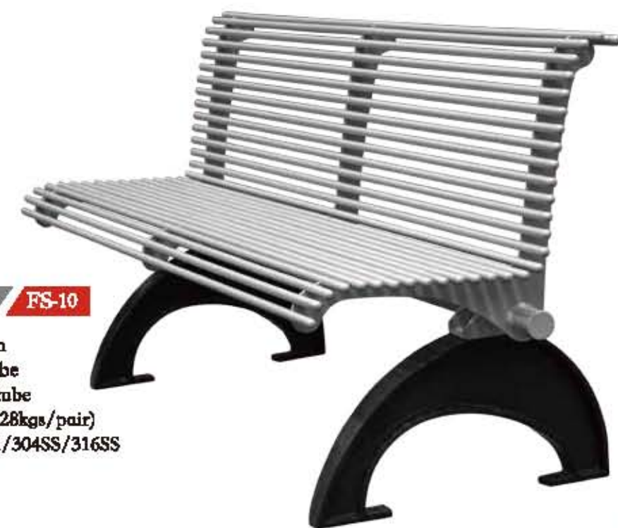
Park long bench FS-10

Size: 1800*600*850mm Leg: cast iron leg (50kgs/pair) Seat: 2.0/2.5mm thk steel plate laser cut pattern Surface treatment: ■ Derusting-spray zinc rich powder -electrostatic powder spray Powder: Akzo Nobel