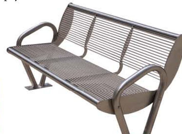
Stainless steel bench FS-08

Size: 1800*560*600mm Seat: Φ8mm round steel bar Leg: Φ48mm steel tube Material: general steel/304SS/316SS Stainless steel surface treatment: wire drawing Surface treatment: ■ Derusting-spray zinc rich powder -electrostatic powder spray Powder: Akzo Nobel