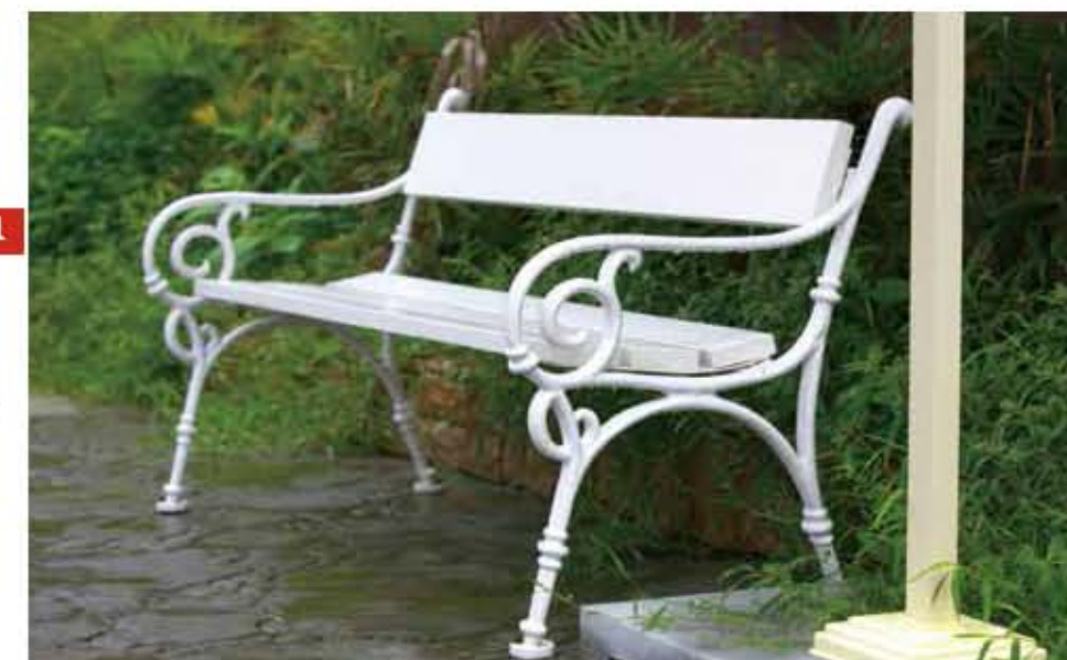
Antique garden wood bench / FW-01

Size: 1800*480*440mm Leg: cast iron leg (24kgs/pair) Seat: \Phi 16mm steel tube Surface treatment: ■ Derusting-spray zinc rich powder -electrostatic powder spray Powder: Akzo Nobel