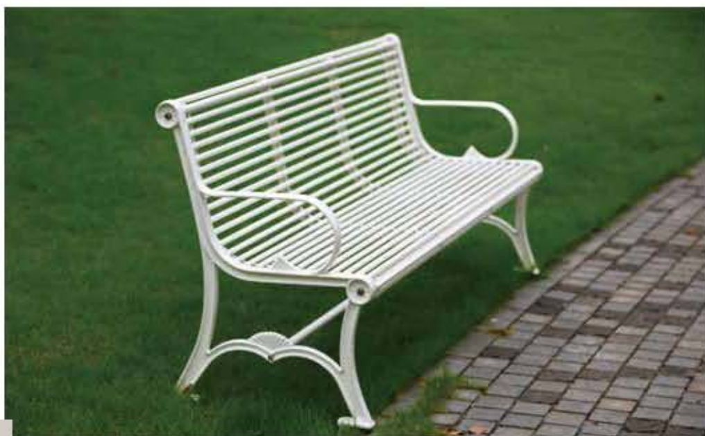
Antique cast iron leg bench / FS-13

Size: 1400* 600*750mm Leg: cast iron leg (28kgs/pair) Seat: solid wood /wood plastic composite (30mm thk) Paint: polyester paint /Germany VMS outdoor paint Steel surface treatment: ■ Derusting-spray zinc rich powder -electrostatic powder spray Powder: Akzo Nobel