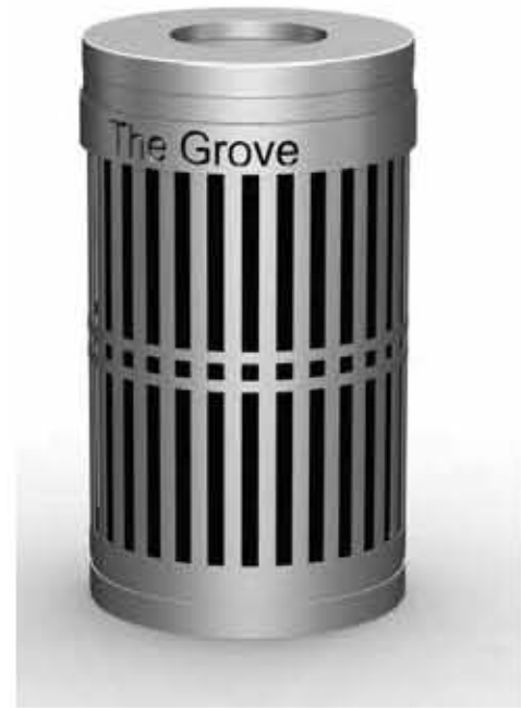
Outdoor trash bin / BS-06

Size: \Phi 450*700 mm Material: 1.2/1.5mm thk flat steel body +2.5mm thk steel plate body +0.5mm thk galvanized iron plate liner