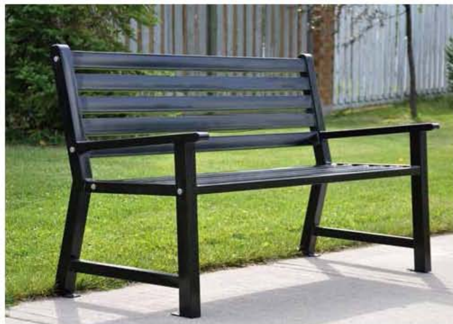
Garden bench FW-11

Size: 1800*450*440mm Seat: solid wood /wood plastic composite (30mm thk) Frame: 40*40mm stainless steel (304SS/316SS)