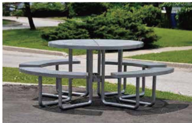
Round metal picnic table TB-03

Whole size: 1700*1700*750mm Table: 800*800*750mm Bench: 800*250*430mm Material: perforated general steel (2.5mm thk) Support pipe: Φ60*3.0mm steel tube