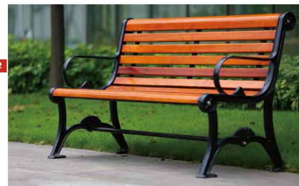
Antique garden wood bench / FW-02

Size: 1800*620*825mm Frame: cast iron leg (24/35kgs/pair) Seat: \Phi 16mm steel tube Surface treatment: ■ Derusting-spray zinc rich powder -electrostatic powder spray Powder: Akzo Nobel