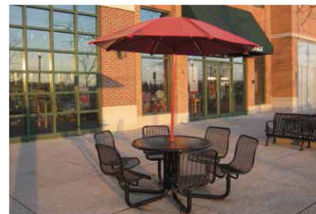
Round metal picnic table TB-11

Whole size: 2040*2040*760mm Table: Φ800*740mm Chair: 400*470*760mm Material: perforated general steel (2.5mm thk) Support pipe: Φ48mm steel tube