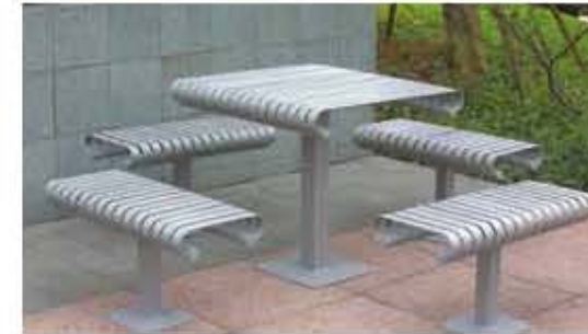
Table and Benches 11