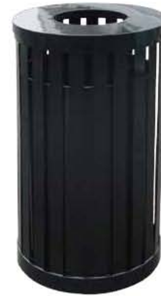
Round trash bin / BS-05

Without cover size: \Phi 622*772 mm With cover size: \Phi 622*1100 mm The trash bin is made by molds. Material: 1.5mm thk steel cover +2.5mm thk steel body +0.5mm thk galvanized iron plate liner