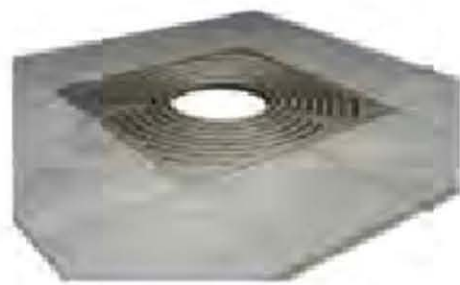
Cast iron tree grate / TG-02

Frame size: \Phi 1000\text{mm} Clear opening: \Phi 500\text{mm} Height: 25mm It is made by mould. Weight: 41kgs Surface treatment: ▪ Derusting-zinc rich powder -electrostatic powder spray Powder: Akzo Nobel