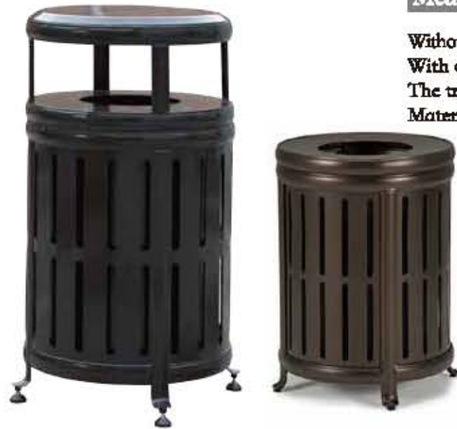
Metal trash bin / BS-01

Without cover size: \Phi 622*772 mm With cover size: \Phi 622*1100 mm The trash bin is made by molds. Material: 1.5mm thk steel cover +2.5mm thk steel body +0.5mm thk galvanized iron plate liner