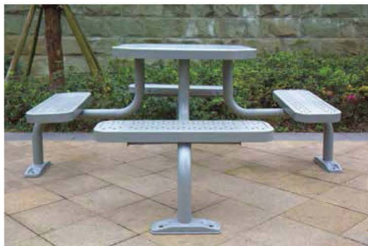
Leisure table sets TB-02

Whole size: 1800*1800*740mm Table: 800*800*740mm Bench: 800*350*440mm Material: general steel (4.0mm thk) Pole: Table: 80*80mm square tube Bench: 60*60mm square tube