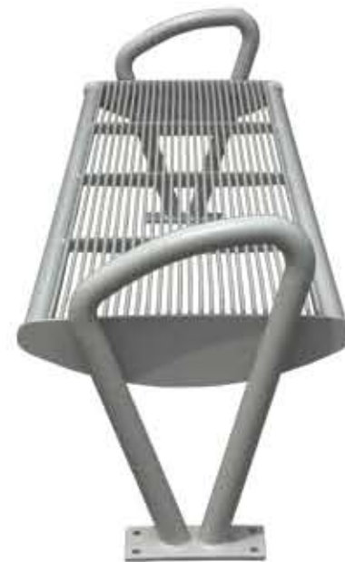
Outdoor bench FS-07

Size: 1800*720*990mm Leg: cast iron leg (50kgs/pair) Seat: 4.0mm thk flat steel by laser cut Middle armrest optional. Surface treatment: ■ Derusting-hot dip galvanizing -electrostatic powder spray ■ Derusting-spray zinc rich powder -electrostatic powder spray Powder: Akzo Nobel