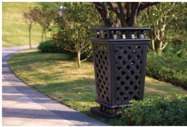
Flat steel trash bin BS-10

Size: 450*450*900mm Material: 1.5mm thk flat steel body +2.5mm thk metal frame +0.5mm thk galvanized iron plate liner