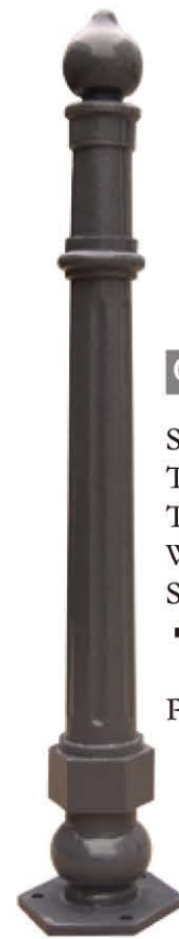
Cast iron bollards / RB-02

Material: 4 mm thk laser cut general steel Frame size: 1200*1200mm Height: 50mm Shape: round/square Surface treatment: ▪ Derusting-zinc rich powder-electrostatic powder spray Powder: Akzo Nobel