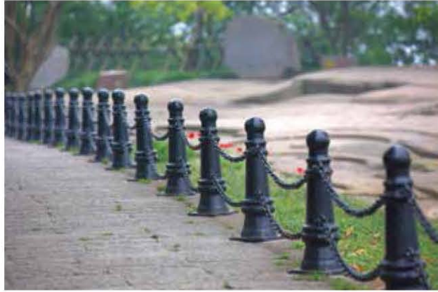
Cast iron bollards / RB-01

Size: \Phi 125*750*\Phi 266\text{mm} This bollard is made by mould. The steel chain is provided. Weight: 35kgs Surface treatment: ▪ Derusting-zinc rich powder -electrostatic powder spray Powder: Akzo Nobel