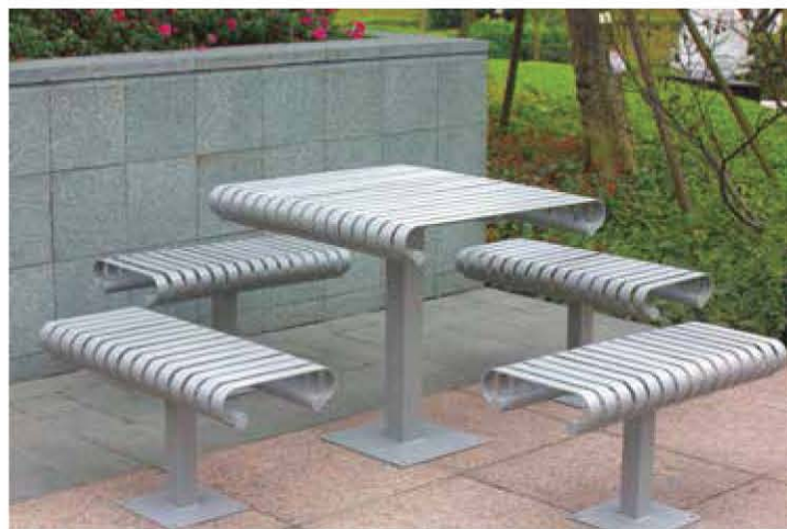
Outdoor picnic table TB-01

Whole size: 1800*1800*740mm Table: 800*800*740mm Bench: 800*350*440mm Material: general steel (4.0mm thk) Pole: Table: 80*80mm square tube Bench: 60*60mm square tube