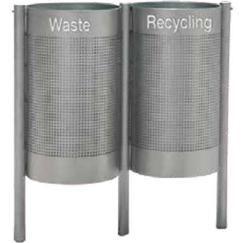
Stainless steel round trash bin BS-16

Size: 520*460*1000mm Material: 201/304/316 perforated stainless steel plate (1.2/1.5mm thk) +0.5mm thk galvanized iron plate /stainless steel liner Finish: wire drawing Pole: Φ 42mm