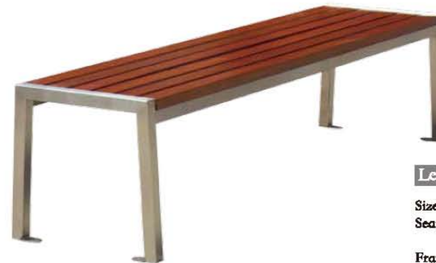
Leisure bench FW-13

Size: 1800*650*800mm Leg: cast iron leg (24kgs/pair) Seat: solid wood /wood plastic composite (30mm thk) Paint: polyester paint /Germany VMS outdoor paint