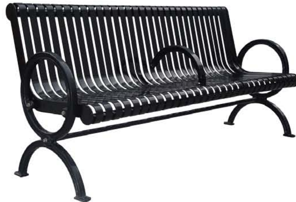
Cast iron bench FS-03

Size: 1800*630*900mm Seat: 4.0mm thk flat steel by laser cut Armrest: 8.0mm thk flat steel Backrest: arc/flat shape Surface treatment: ■ Derusting-hot dip galvanizing -electrostatic powder spray ■ Derusting-spray zinc rich powder -electrostatic powder spray Powder: Akzo Nobel