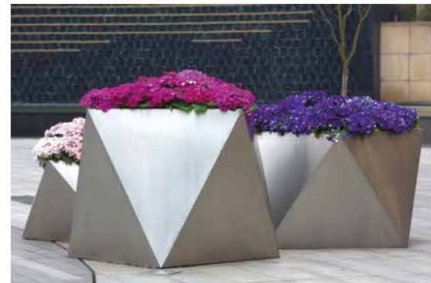
Stainless steel planter / FB-06

Size: 700*700*980mm Material: 201/304/316 stainless steel (2.0/2.5mm thk) Finish: wire drawing