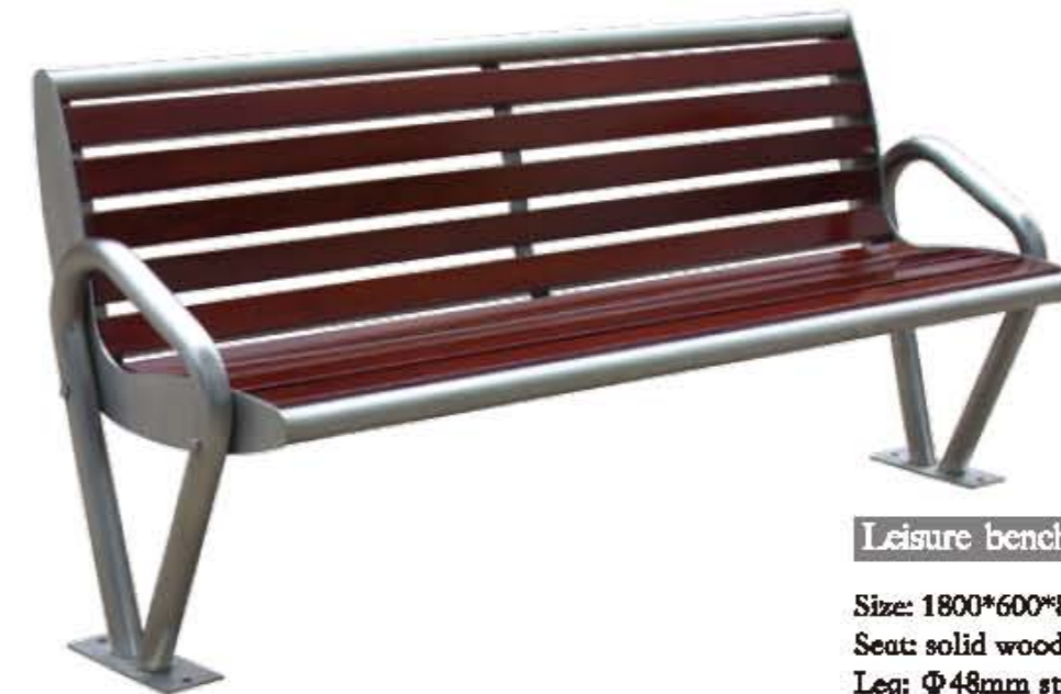
Leisure bench FW-14

Size: 1800*600*810mm Seat: solid wood/wood plastic composite (30mm thk) Leg: Φ48mm steel tube (304SS/316SS) Paint: polyester paint /Germany VMS outdoor paint