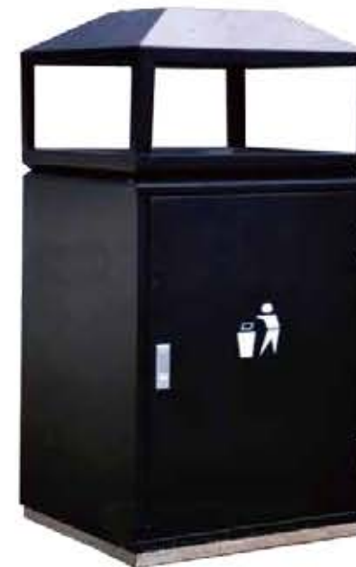
Square trash bin / BS-08

Size: \Phi 450*850 mm Material: 2.5mm thk flat steel body +0.5mm thk galvanized iron plate liner Option: rain cover and ashtray