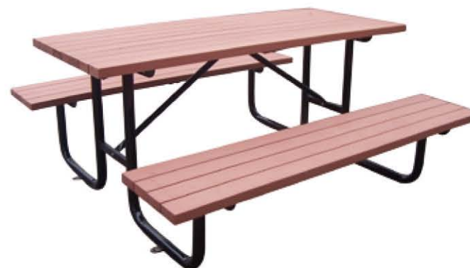
Table and benches TB-07

Whole size: 1800*1350*750mm Table: 1800*600*750mm Bench: 1800*250*450mm Wood: solid wood/wood plastic composite Paint: polyester paint /Germany VMS outdoor paint Support pipe: Φ42mm steel tube