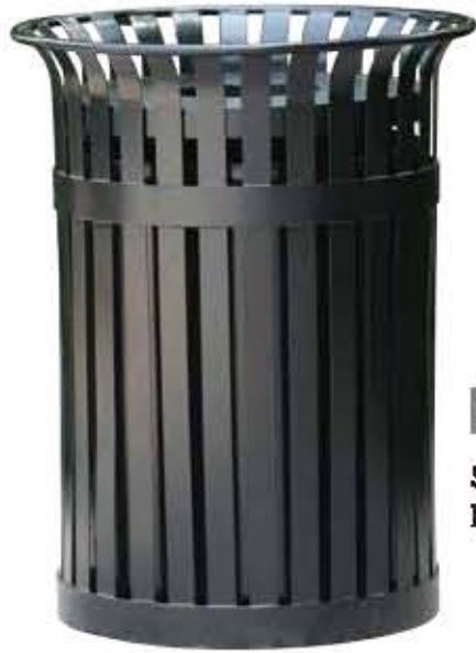
European style trash bin / BS-02

Size: \Phi 380*800 mm Material: 1.5mm thk steel plate cover +2.5mm thk steel plate body +0.5mm thk galvanized iron plate liner