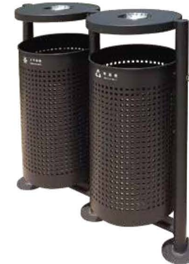
Stainless steel trash bin BS-18

Size: 905*380*910mm Material: 1.5mm thk perforated steel plate +0.5mm thk galvanized iron plate liner Pole: Φ 48mm