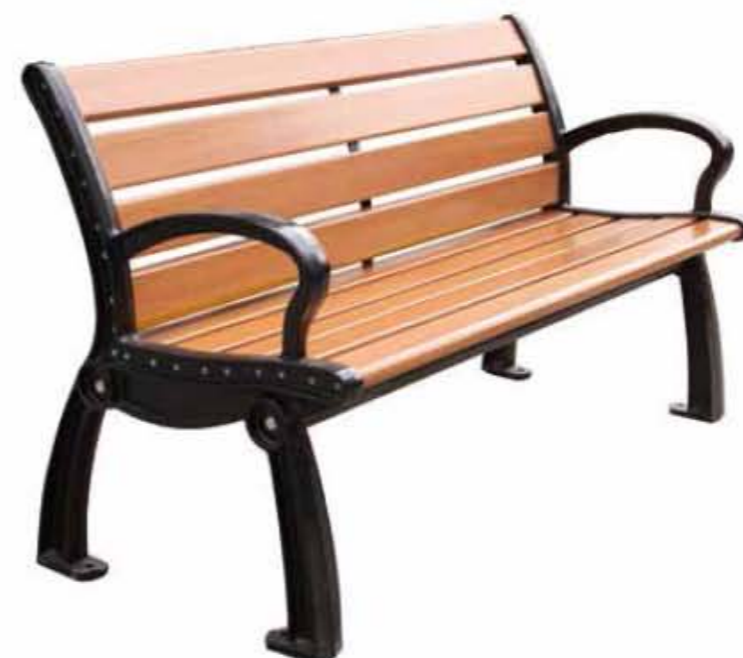
Garden bench FW-12

Size: 1800*590*770mm Leg: cast iron leg (28kgs/pair) Seat: solid wood /wood plastic composite (30mm thk) Paint: polyester paint /Germany VMS outdoor paint