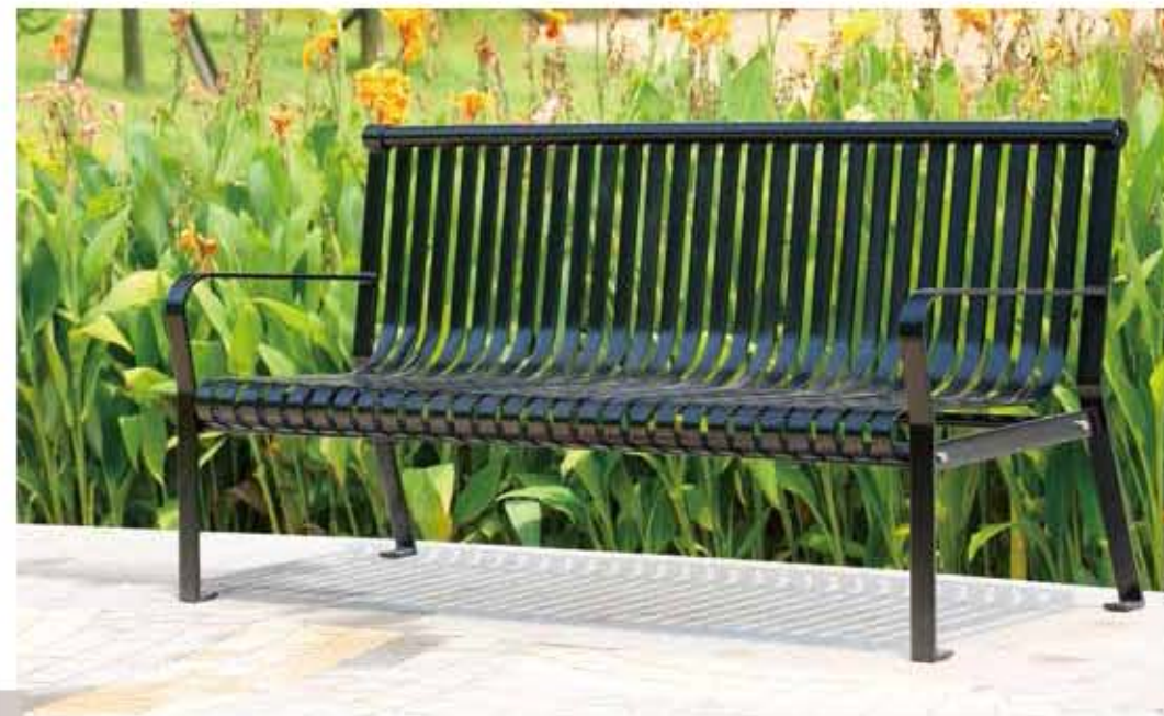
Flat steel bench FS-01

Size: 1800*630*860mm Seat: 4.0mm thk flat steel by laser cut Frame: 30*30mm steel tube Surface treatment: ■ Derusting-hot dip galvanizing-electrostatic powder spray ■ Derusting-spray zinc rich powder-electrostatic powder spray Powder: Akzo Nobel