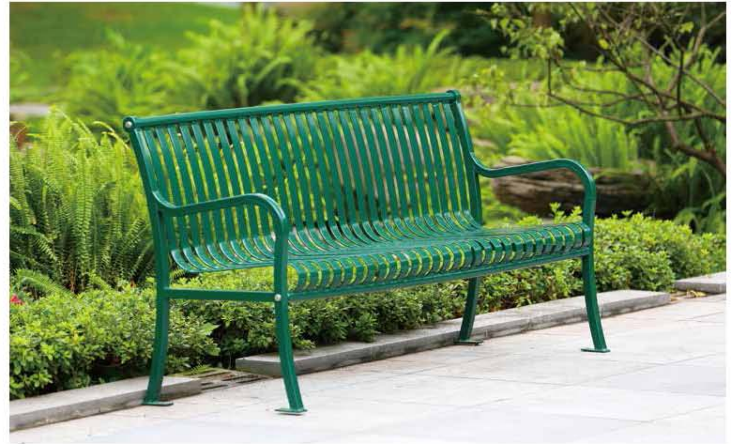
Flat steel bench FS-02

Size: 1800*630*860mm Seat: 4.0mm thk flat steel by laser cut Frame: 30*30mm steel tube Surface treatment: ■ Derusting-hot dip galvanizing-electrostatic powder spray ■ Derusting-spray zinc rich powder-electrostatic powder spray Powder: Akzo Nobel