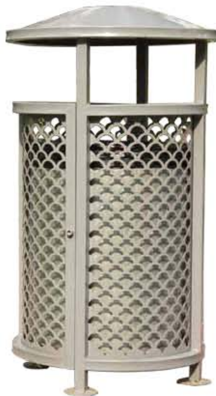
Park trash bin / BS-04

Size: \Phi 460*800 mm Material: 1.2mm thk steel plate cover +1.5mm thk steel plate bin body +0.5mm thk galvanized iron plate liner