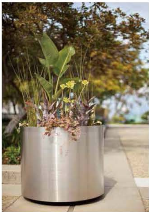
Stainless steel planter / FB-01

Size: \Phi 500*680mm Material: 201/304/316 stainless steel (2.0/2.5mm thk) Finish: wire drawing