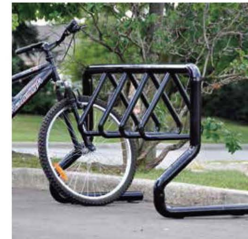
Bike racks / BR-05

Material: general steel tube ( \Phi 60\text{mm}\&\Phi 32\text{mm} ) Size: 1230*550*800mm Surface treatment: ▪ Derusting-zinc rich powder -electrostatic powder spray Powder: Akzo Nobel