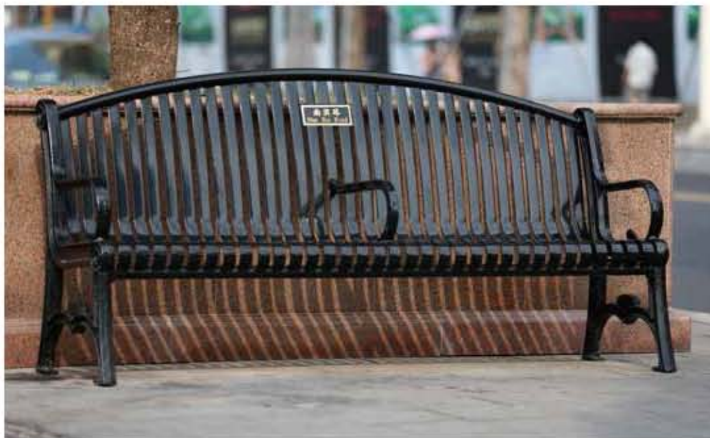
Cast iron bench FS-04

Size: 1800*720*990mm Leg: cast iron leg (50kgs/pair) Seat: 4.0mm thk flat steel by laser cut Middle armrest optional. Surface treatment: ■ Derusting-hot dip galvanizing -electrostatic powder spray ■ Derusting-spray zinc rich powder -electrostatic powder spray Powder: Akzo Nobel