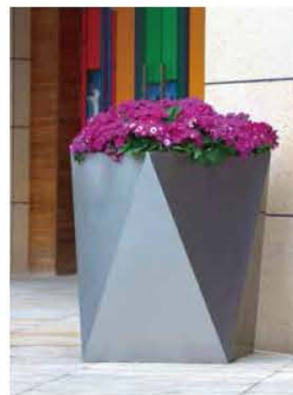
Stainless steel planter / FB-05

Size: 700*700*980mm Material: 201/304/316 stainless steel (2.0/2.5mm thk) Finish: wire drawing