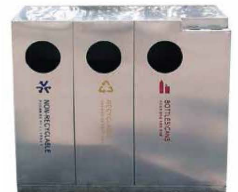
Stainless steel trash bin BS-20

Size: 1000*400*1000mm Material: 201/304/316 stainless steel plate (1.2/1.5mm thk) +0.5mm thk galvanized iron plate /stainless steel liner Finish: wire drawing