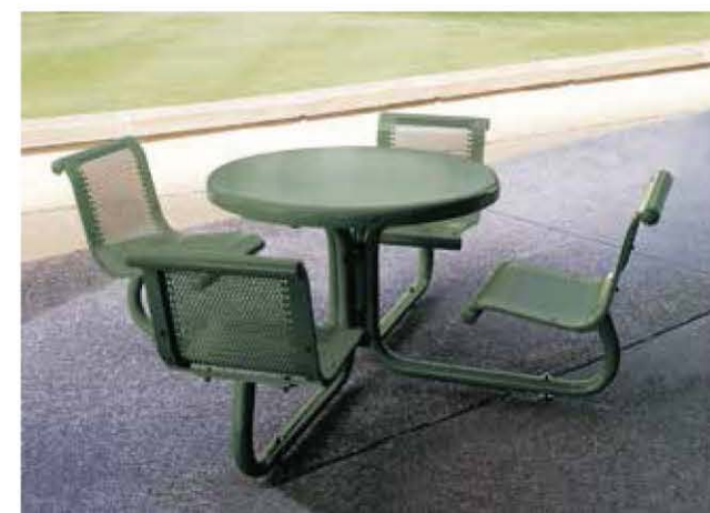
Table and chairs TB-10

Whole size: 2000*2000*740mm Table: 1000*1000*740mm Bench: 1000*350*440mm Material: perforated general steel (2.5mm thk) Support pipe: Φ42mm steel tube