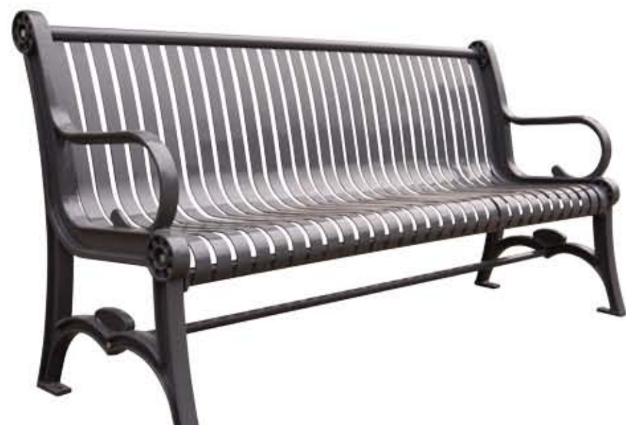
Cast iron bench FS-05

Size: 1800*650*770mm Seat: Φ8mm round steel bar Leg: Φ48mm steel tube Material: general steel/304SS/316SS Stainless steel surface treatment: wire drawing