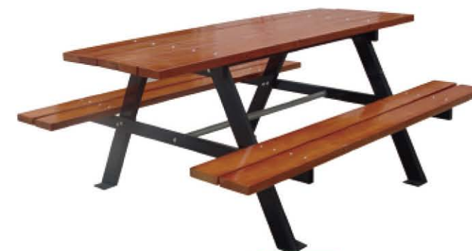
Table and benches TB-08

Whole size: 1800*1740*740mm Table: 1800*720*740mm Bench: 1800*360*440mm Wood: solid wood/wood plastic composite Paint: polyester paint /Germany VMS outdoor paint Support pipe: Φ42mm steel tube