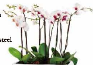
Stainless steel planter set / FB-04

Size: Small: 400*400*480mm Big: 500*500*780mm Material: 201/304/316 stainless steel (2.0/2.5mm thk) Finish: wire drawing