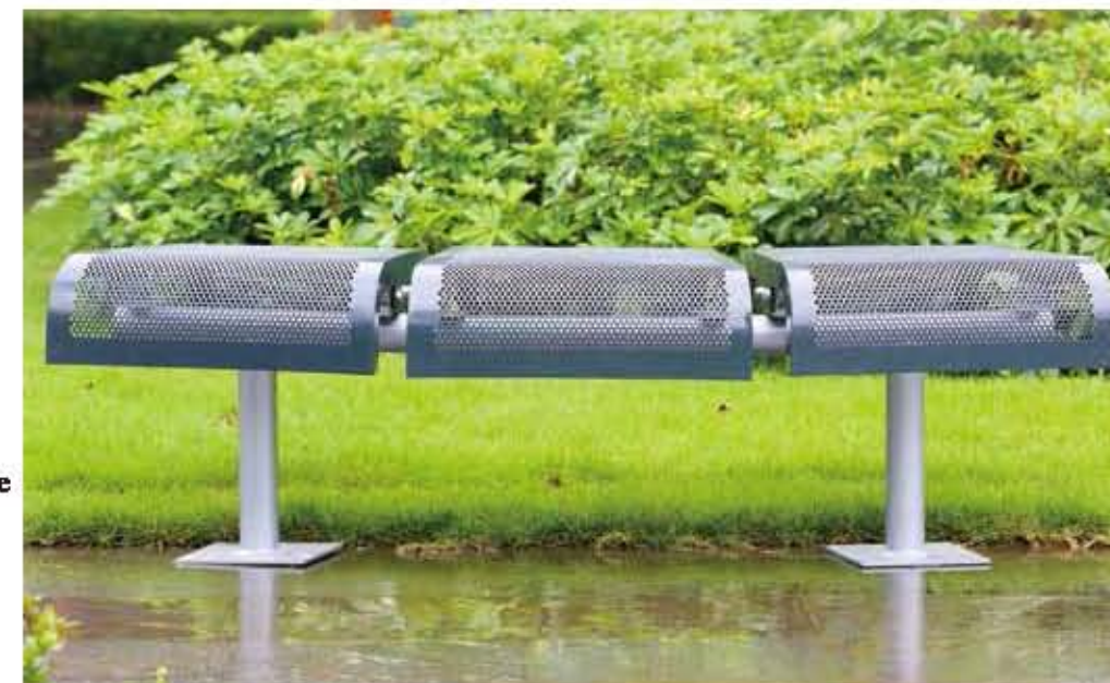
Perforated bench / FS-14

Size: 1800*810*840mm Seat: 2.0/2.5mm thk perforated steel plate Frame: \Phi 42mm steel tube Armrest: middle armrest optional