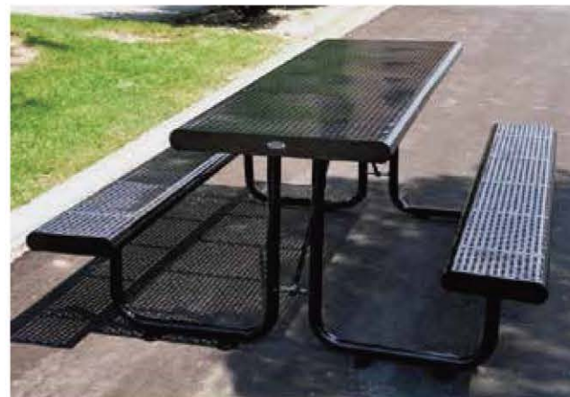
Steel table and bench TB-05

Table: Φ800*740mm Chair: 500*580*850mm Material: 304SS (3.0/4.0mm thk)