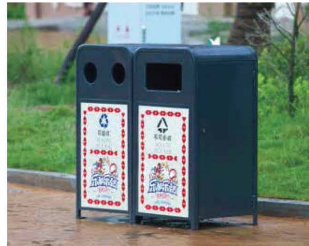
Recycle bin BS-13

Size: 1000*500*1000mm It is consist of 2 one-bucket trash bins. Material: 1.5/2.0mm thk steel plate +0.5mm thk galvanized iron plate liner