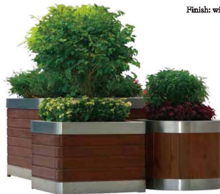
Wooden planter set / FB-07

Size: Small: 1000*1000*580mm Medium: 1000*1000*780mm Big: 1000*1000*980mm Material: 201/304/316 stainless steel (2.0/2.5mm thk) Finish: wire drawing