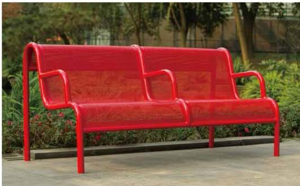
Perforated steel bench / FS-11

Size: 1800*810*840mm Seat: 2.0/2.5mm thk perforated steel plate Frame: \Phi 42mm steel tube Armrest: middle armrest optional