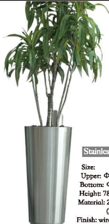
Stainless steel planter / FB-02

Size: \Phi 500*680mm Material: 201/304/316 stainless steel (2.0/2.5mm thk) Finish: wire drawing