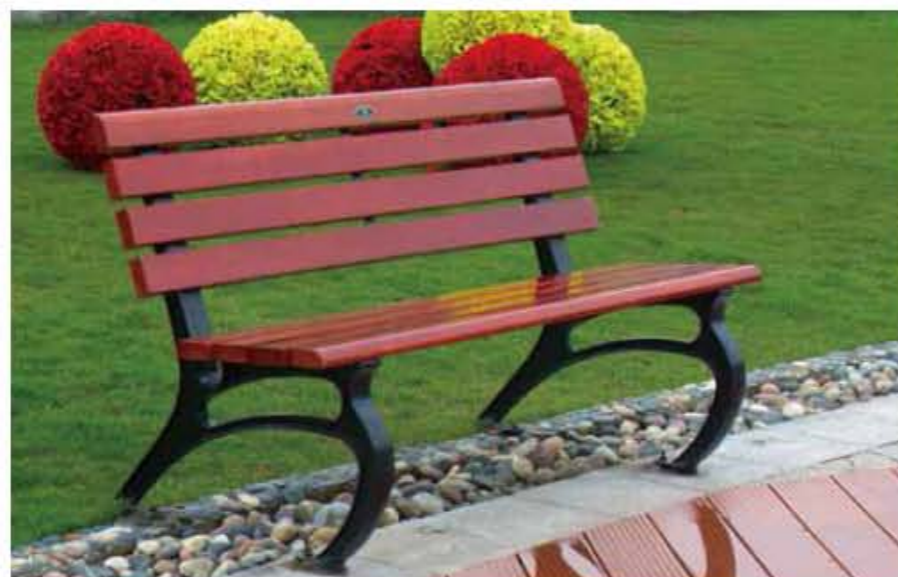
Curvature wooden bench FW-10

Size: 1800*570*745mm Leg: cast iron leg (27.6kgs/pair) Seat: solid wood /wood plastic composite (30mm thk) Paint: polyester paint / Germany VMS outdoor paint