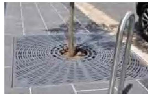
Hollowed-out tree grate / TG-03

Material: 4mm thk laser cut general steel Frame size: 1600*1600 mm Height: 50mm Shape: round/square Surface treatment: ▪ Derusting-zinc rich powder-electrostatic powder spray Powder: Akzo Nobel