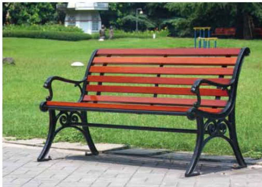
Garden bench FW-09

Size: 1800*590*770mm Leg: cast iron leg (28kgs/pair) Seat: solid wood /wood plastic composite (30mm thk) Paint: polyester paint /Germany VMS outdoor paint